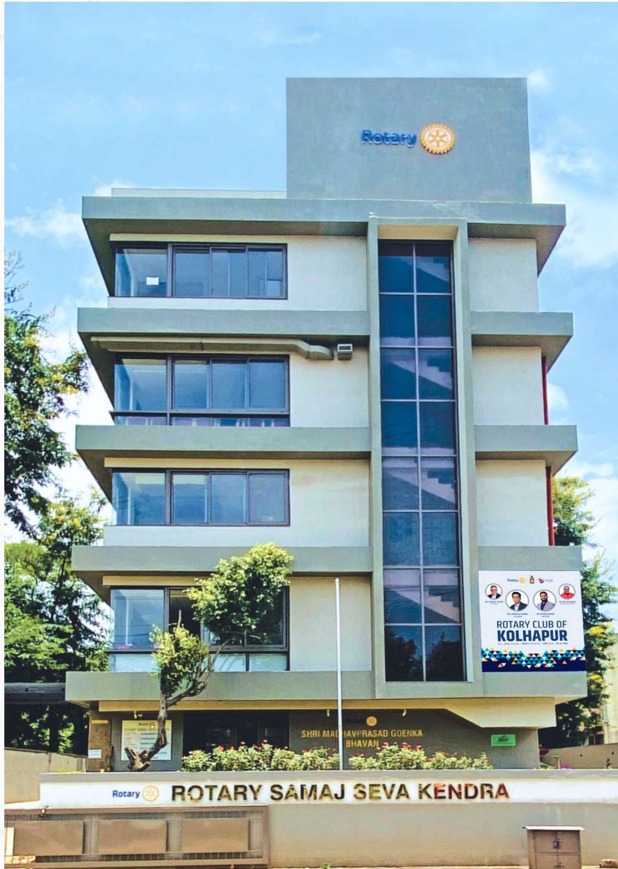
ROTARY CLUB OF KOLHAPUR'S ROTARY SAMAJ SEVA KENDRA BUILDING